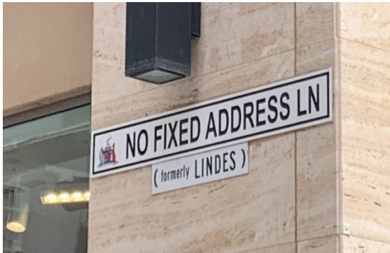
Figure 2. Image of No Fixed Address street sign (formerly LINDES).