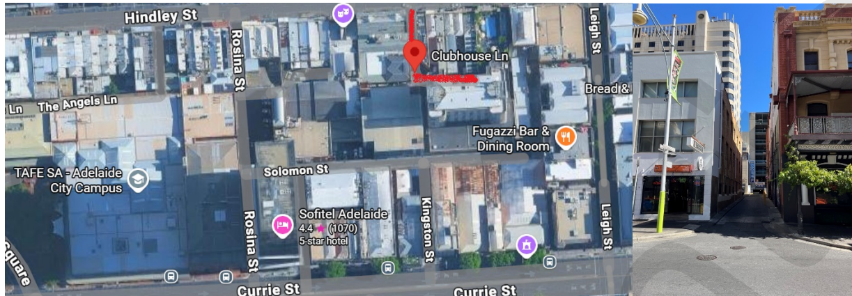
Figure 1: Aerial view map and street view of Clubhouse Lane (off Hindley Street)

11.2.1.7 No business or residential entities hold this location as their street address.