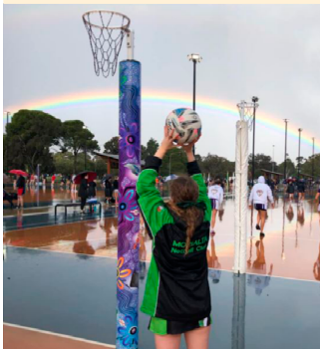
New pole covers in use in Josie Agius Park/Wikaparntu Wirra (Park 22)

Aboriginal people and their culture make up the landscape of our country and artwork, such as displayed on the pole covers, should be considered a normal part of our everyday observations and experiences." – Parent of Junior Netball participant