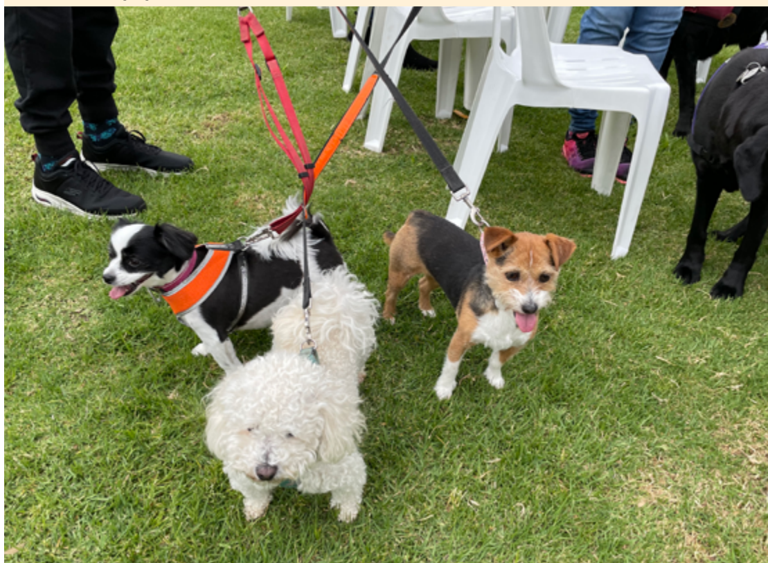
Some of the pups who walked with owners

The event was very popular with around 150 attendees ranging from RSB clients and volunteers, puppy educators and the wider community, including some city residents. Participants were keen to see this become an annual event for the city.