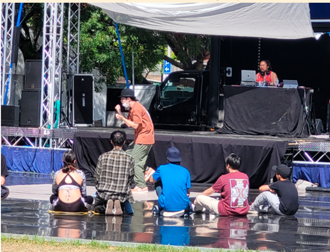
Freestyle dancers at the Quicksteps Ballroom in Wauwi/Light Square

"Loved the event, great seeing everyone come together. Great Vibes! Opportunities to see what's happening in creative scenes". – Event attendee