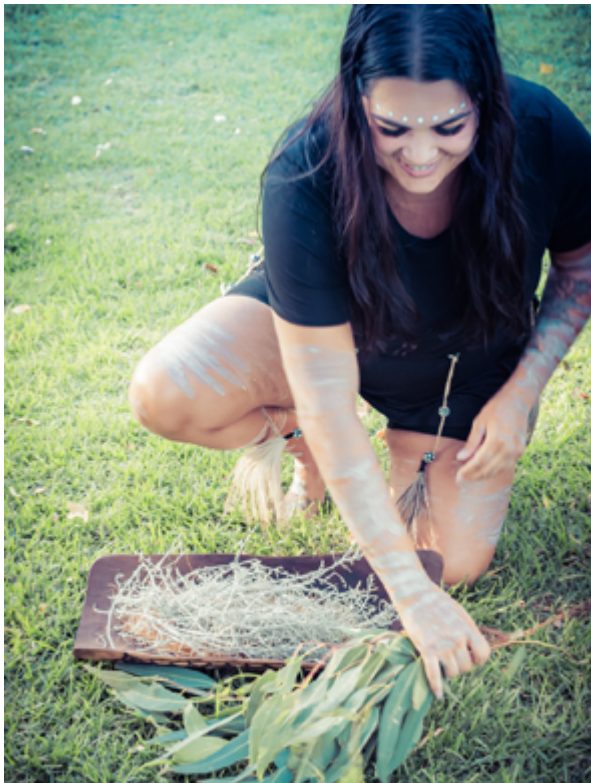
Image Island Night Smoking Ceremony

This free community event offered an excellent opportunity for the community to come together. Over 200 people from all backgrounds attended of which 20 per cent were city residents. It was a great success and appreciated not only by those who were lucky enough to attend but also by the performers. A special acknowledgment to contributions made by female led Kaurna women's cultural group Ngangkari Warra.