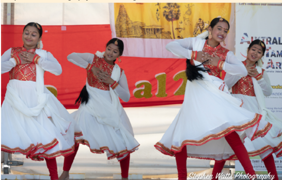
Adelaide Pongal Festival 2022

Find out more: facebook.com/AdelaidePongalTHEHARVESTFESTIVAL