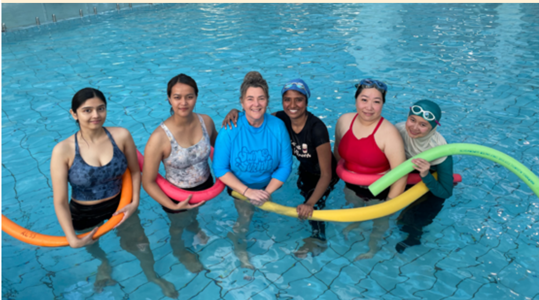
Participants in the Swim and Survive English Literacy Program with their instructor at Adelaide Aquatic Centre

Find out more: News — Royal Life Saving South Australia ( royallifesavingsa.com.au )