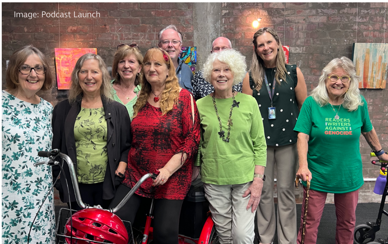
Image: Podcast Launch

'Life in the City' is a brand-new podcast celebrating stories, ideas and conversations about ageing well in Adelaide. Featuring local residents, community leaders and experts, the series explores what it means to stay active, connected and engaged in city life.