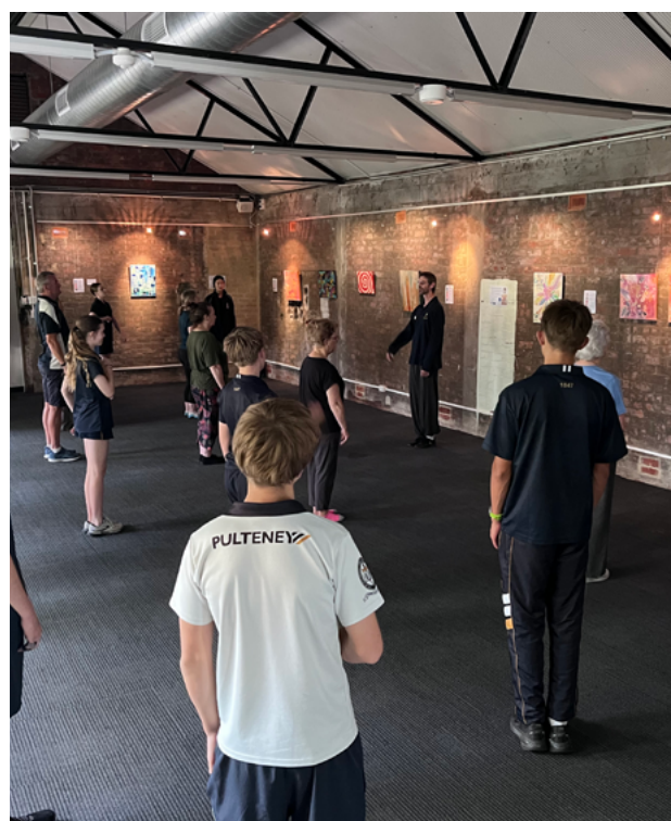
Images: Pulteney Grammar School visit