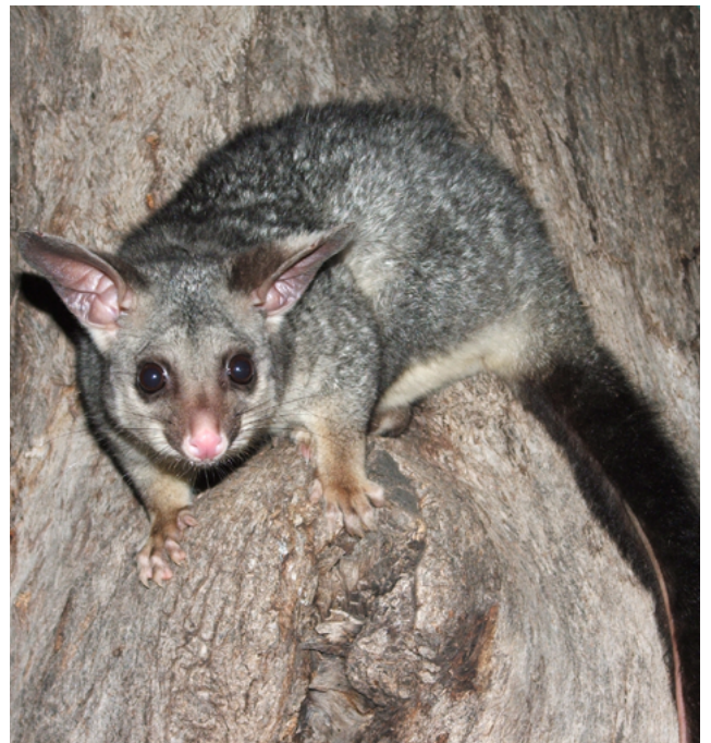
Image: Brushtail Possum

As a community, we share a responsibility to care for and protect them, for example, by preserving the trees in the Park Lands and Possum Park, a space long known as a natural home for possums.