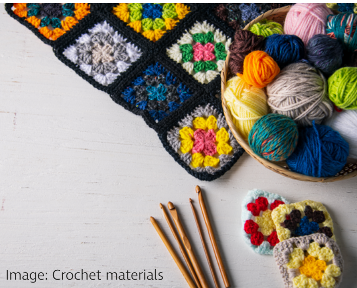
Image: Crochet materials

Whether you're a seasoned crocheter or curious to learn, join us for connection, creativity, and community at the Hutt Street Library. Some sessions will run with a facilitator available for questions, while others will be self guided: perfect for sharing skills and ideas together.