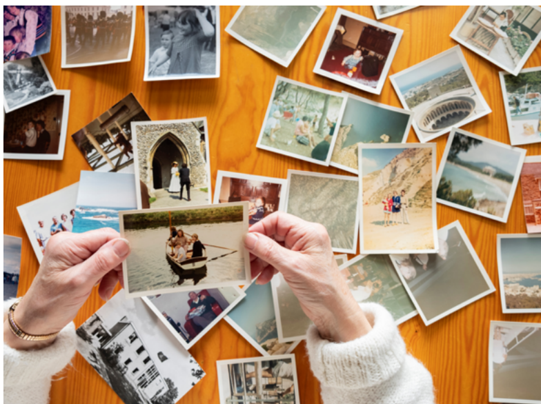
Image: Family photos

Learn how to digitise your precious photos and important documents with the help of our tech-savvy History Hub Team. We can teach you how to scan your photos, slides or negatives with our top of the range Epson scanner.