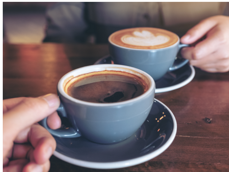
Image: Coffee and conversation

You are invited to our free monthly event of coffee, conversation, and community. Join us for a free cuppa and chat with our Library Connections Team.