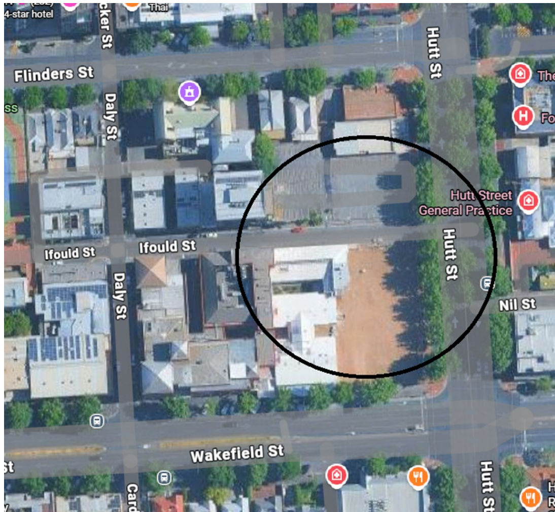
Map of the area that potentially persons may be affected to be notified