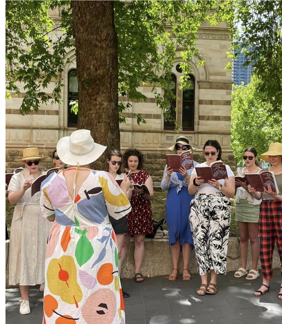
Image: Aurora Vocal Ensemble pop-up performance at State Library of South Australia. Presented as part of Singing Adelaide, a Cultural Strategic Partnership between the Adelaide Choral Network and the City of Adelaide.

Together , we will bring fun, lively and interesting arts and cultural experiences to the city and enable a vibrant, connected and inclusive community.