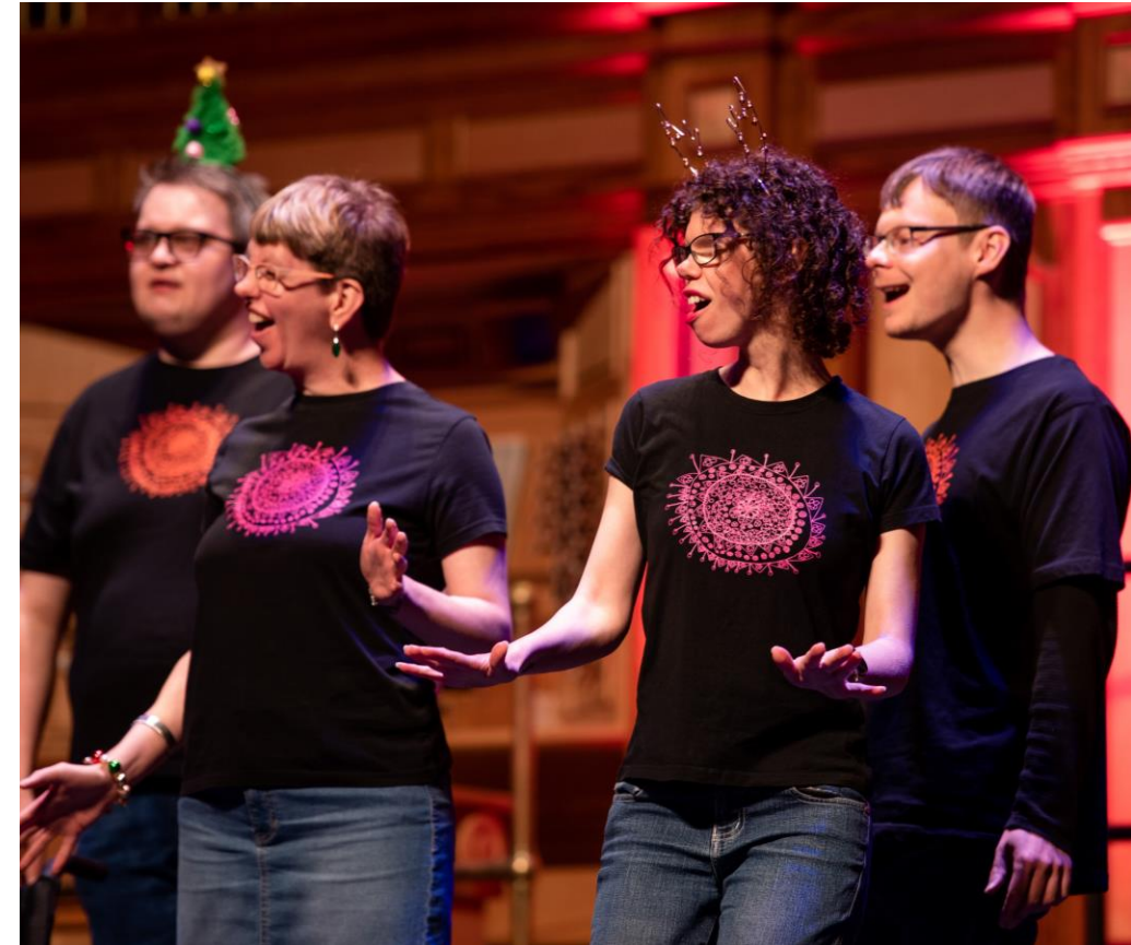
Image: Thank God It's Friday choir performing at the Adelaide Town Hall Christmas Concert 2022.