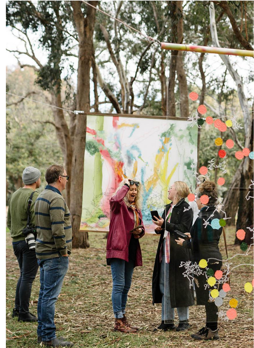
Image: The ParkLands Project presented by OSCA at Tuthangga, Carriageway Park 17 as part of SA History Festival 2021.