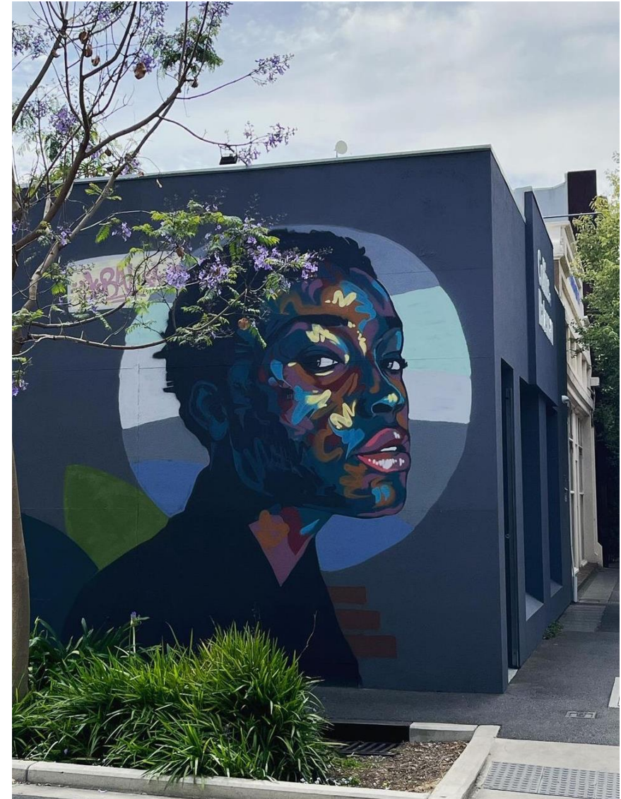
Image: Sanaa Festival Mural at Halifax Street by South African artist @Skubalisto, 2023