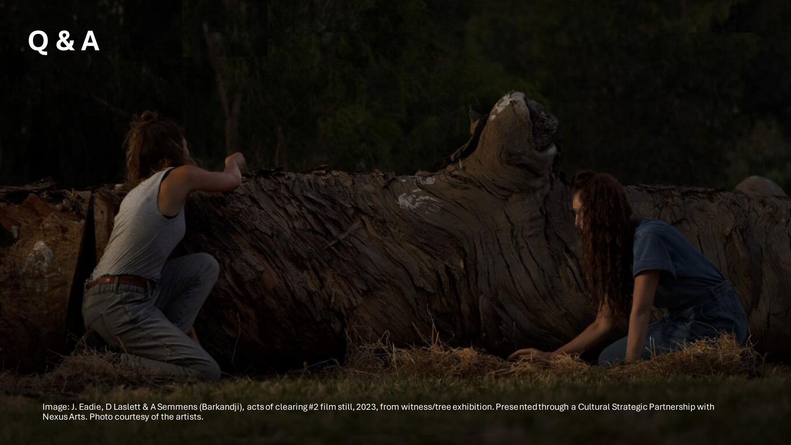
Image: J. Eadie, D Laslett & A Semmens (Barkandji), acts of clearing#2 film still, 2023, from witness/tree exhibition. Presented through a Cultural Strategic Partnership with NexusArts.