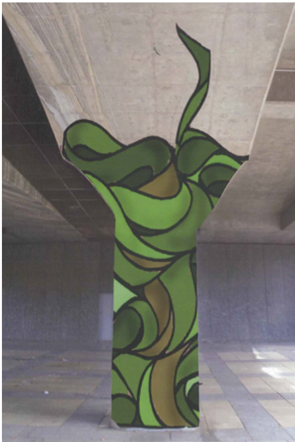
EXAMPLE OF SUBMITTED INFORMATION Mock-up of the proposed artwork for the southern pylons. Material: aerosol paint