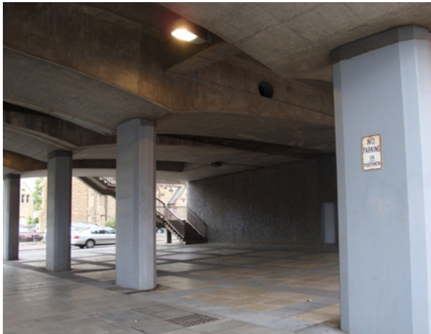
EXAMPLE OF SUBMITTED INFORMATION Location under Morphett Street Bridge (before work commenced) – Artwork to be installed on southern pylons

This guide has been developed to assist artists through the process of obtaining Development Approval. For further information or to discuss your specific requirements, please contact Council's Development Assessment team on 08 8203 7185 or d.planner@cityofadelaide.com.au .