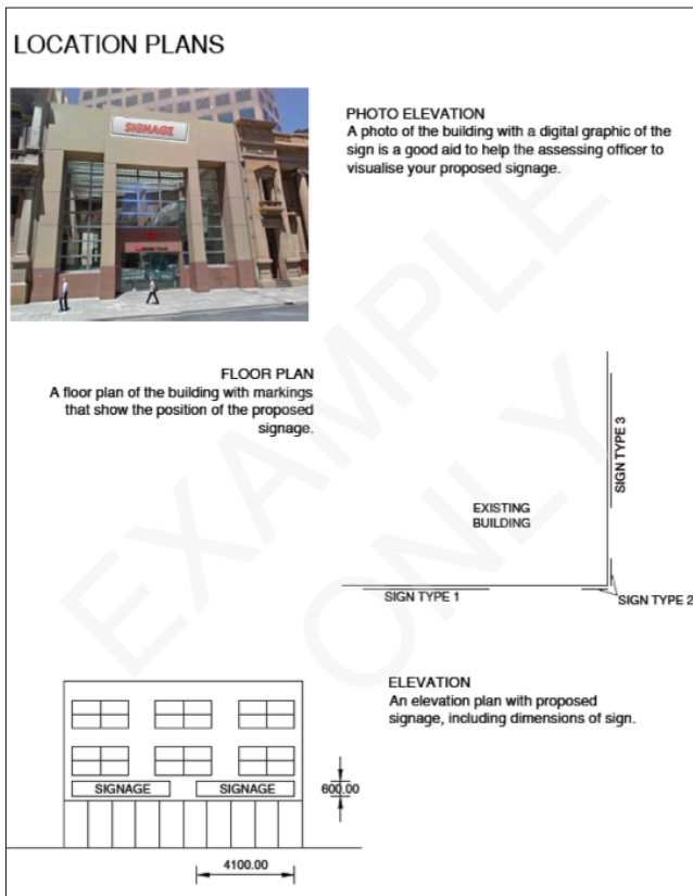
Example of Site, Location and Elevation Plan