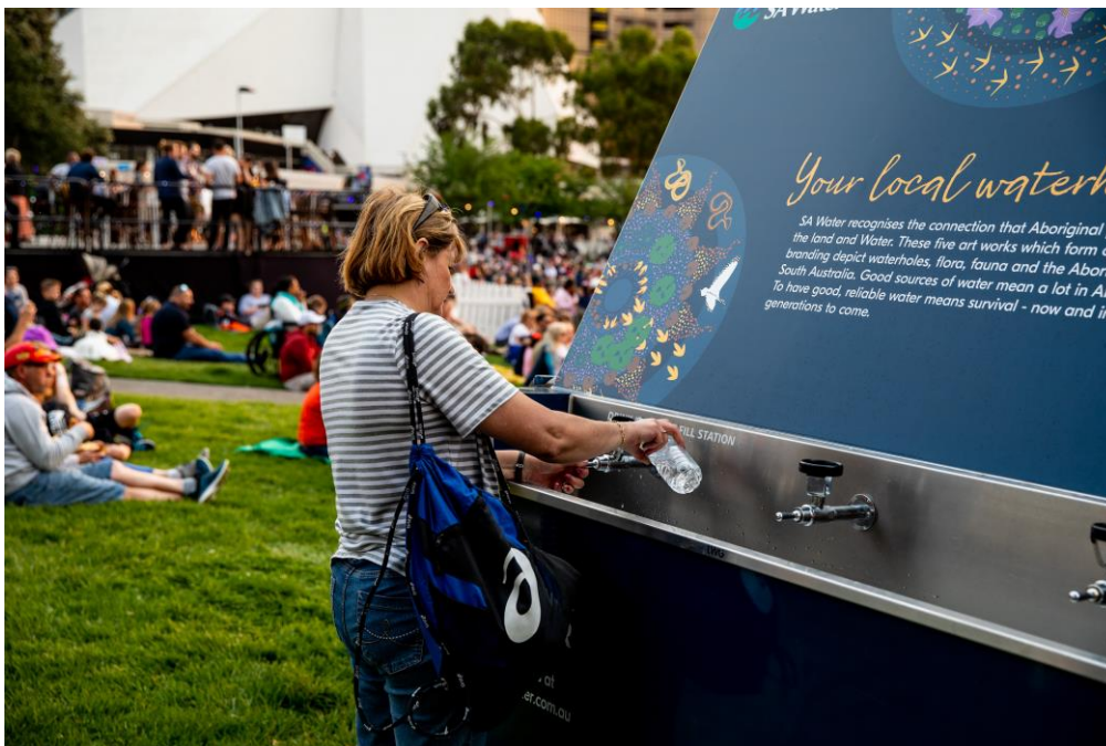
Free refills! Helping patrons stay hydrated more sustainably.