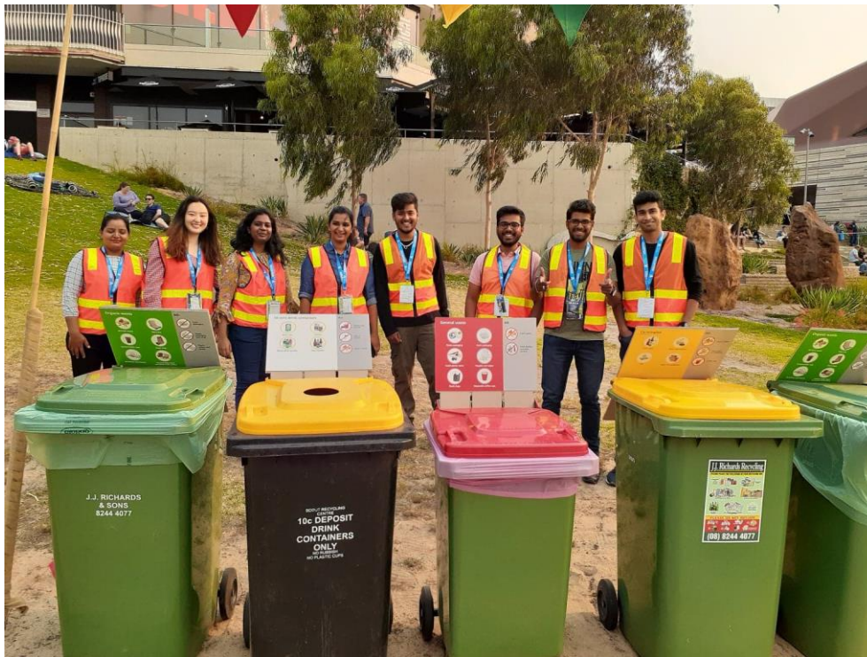
Volunteer team on hand to give advice and information on the night.