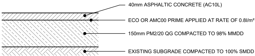
CoA 408 PARK LANDS ASPHALT FOOTPATH DETAIL SCALE 1:10 @ A3