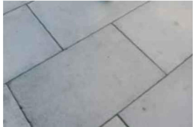
Concrete Flagstone Pavers

North Adelaide: Standard Grey Concrete Pavers