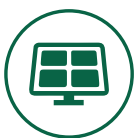
Solar PV systems

Visit our website for the full range of sustainability incentives and eligibility criteria.