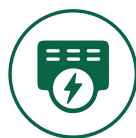
Electricity load control