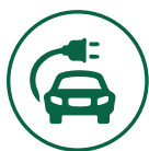
Electric vehicle charging