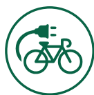
Electric bike charging