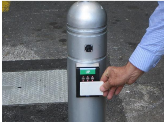
Swipe to raise bollards

To RAISE the bollards place the swipe card against the bollard labelled UP - the RED LED indicator will turn green when successfully activated.