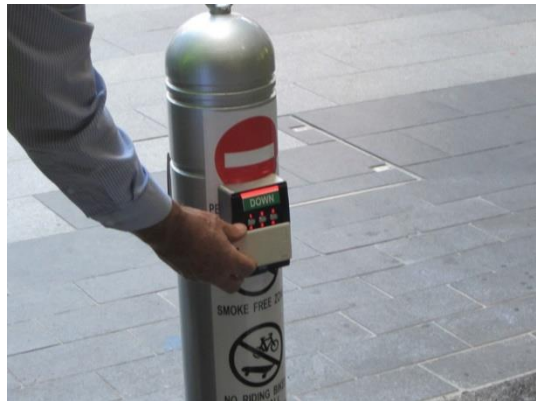
Swipe to lower bollards

To LOWER the bollards place the swipe card against the keypad labelled DOWN – the RED LED indicator will turn green when successfully activated.