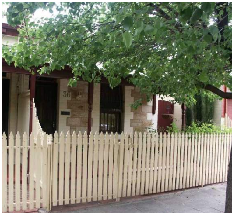
Attached cottage, 36 Delhi Street — View to northeast