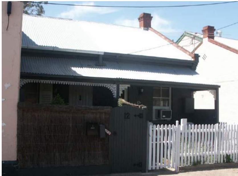
Attached cottage, 12 Ada Street — View to southeast

OTHER ASSESSMENTS McDougall & Vines 1993