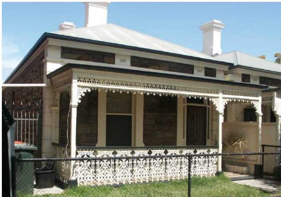
Cottage, 269 Carrington Street — View to southwest

OTHER ASSESSMENTS McDougall & Vines, 1993