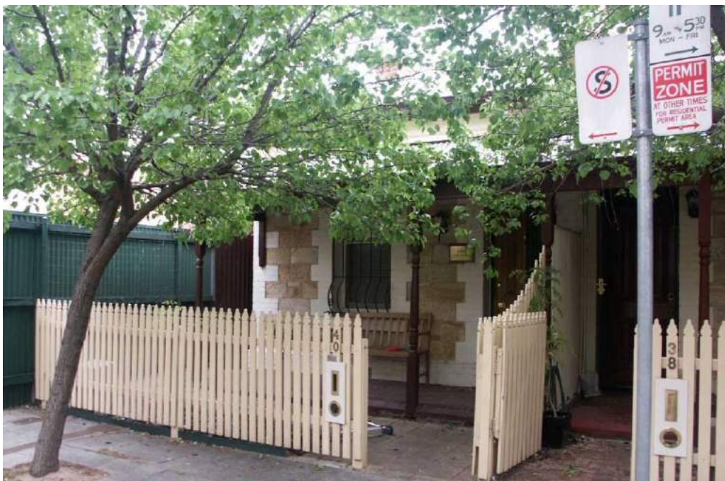
Attached cottage, 40 Delhi Street — View to northwest