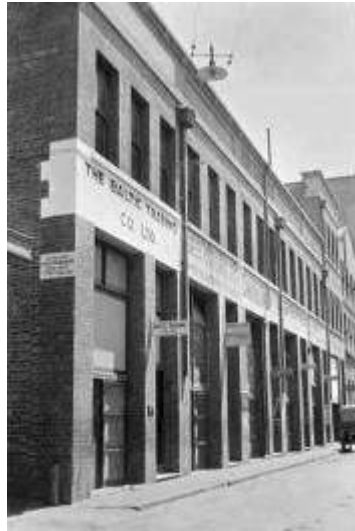
B.2035, February 1924 (SLSA)