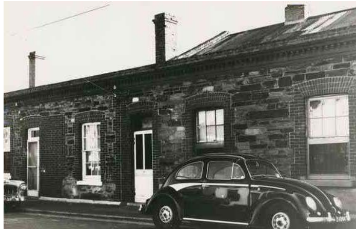
Claxton Street, 1963