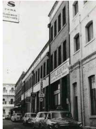
B.15605, October 1964