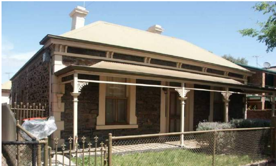
Villa, 265 Carrington Street — View to southwest

OTHER ASSESSMENTS McDougall & Vines, 1993