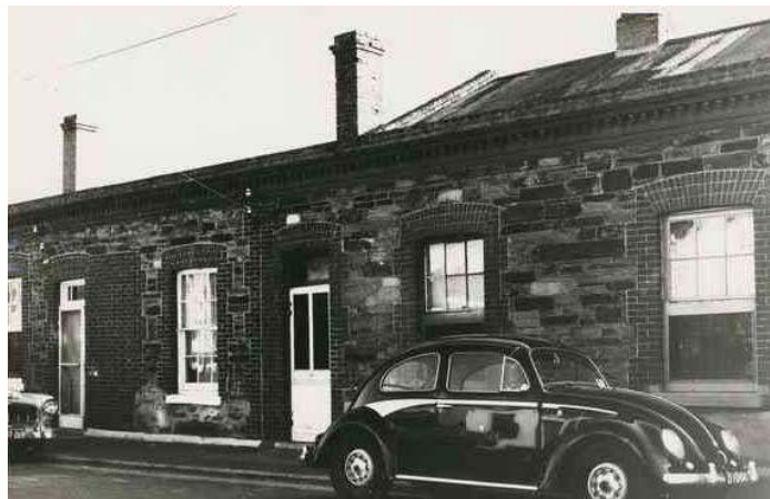
Claxton Street, 1963