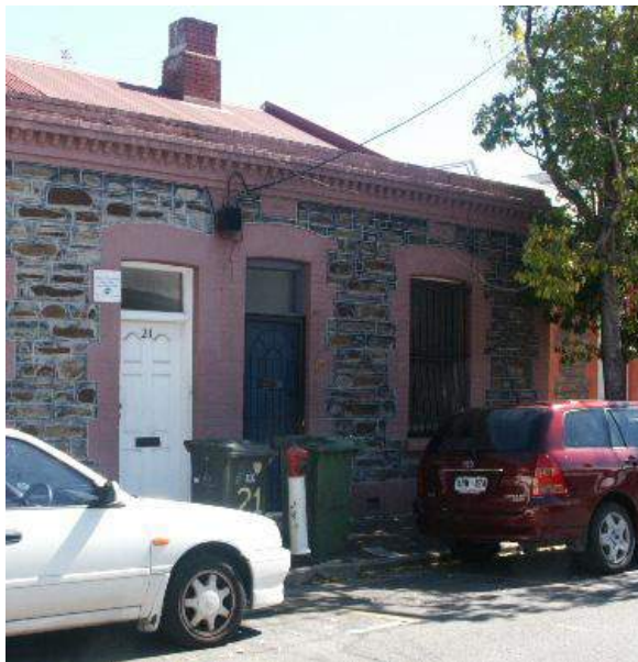
Attached cottage, 19 Claxton Street – View to northwest

OTHER ASSESSMENTS Donovan Marsden & Stark, 1982; City of Adelaide Heritage Study, 1990; McDougall & Vines, 1993.