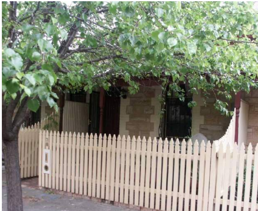
Attached cottage, 38 Delhi Street — View to northwest

OTHER ASSESSMENTS McDougall & Vines, 1993