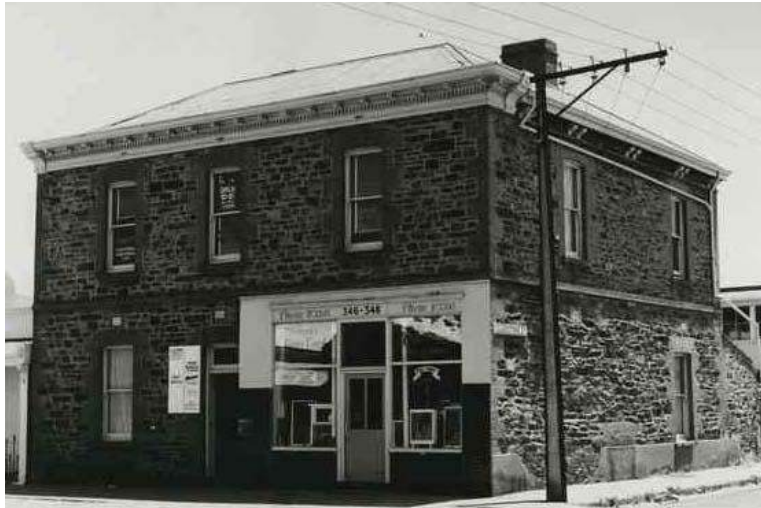
Carrington Street, 1963

Alterations and additions have occurred to the building over the years: new toilets (1960); office and store additions (1963); and in 1968 alterations that resulted in the removal of the shop front. In 1977, Council sought the advice of the National Trust of South Australia following an application to undertake restoration work on the building then used for office purposes. The former shop was listed by the National Trust on its Recorded List, and its advice to Council noted that 'it would not be in the best interests of the building to apply cement render on the existing stonework and brickwork'. The builder for the project was Alan Sheppard Constructions Pty Ltd. In 1991, Council approved the erection of a canopy over the main front entrance to the building; this was completed by 11 September 1992.