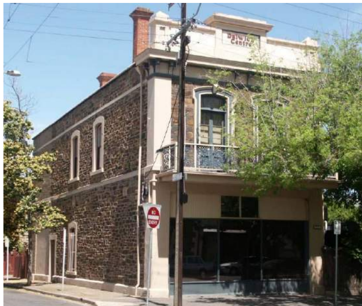
Dulwich Centre, 345–349 Carrington Street — View to southwest

OTHER ASSESSMENTS McDougall & Vines, 1993