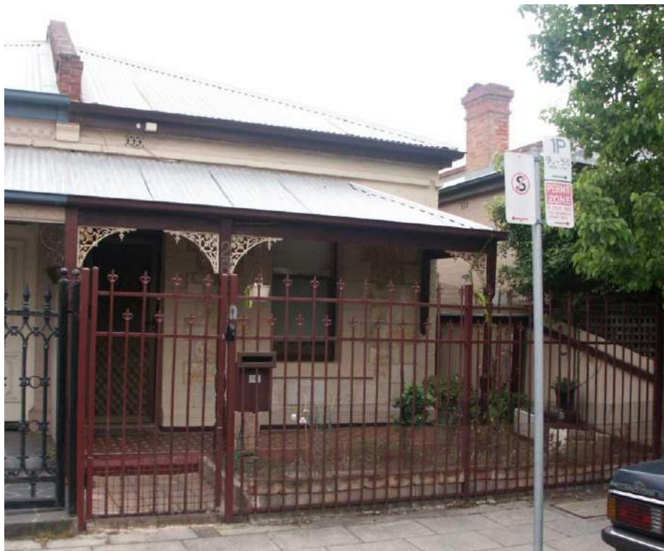
Attached cottage, 28 Delhi Street — View to north

HERITAGE STATUS: Local Heritage Place OTHER ASSESSMENTS Nil