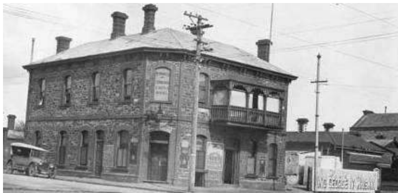
B.3733, August 1926