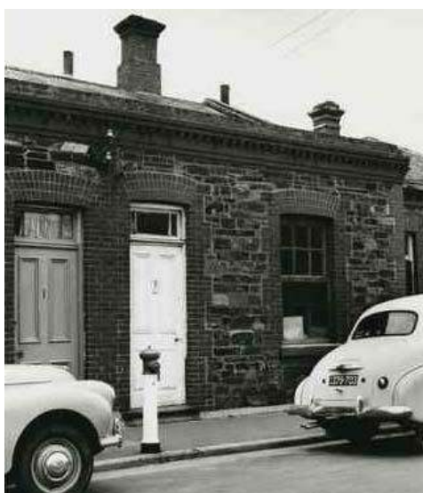
Claxton Street, 1963

A bathroom and sleepout were added to the building in 1957 by Pizarcoff, the owner-builder. In 1963 the dwelling was converted into a shopfront by the owner; and in 1966 another owner built a laundry, bathroom and verandah. In November 1965, the Adelaide Local Board of Health declared the three-room dwelling (with a dilapidated timber frame lean-to laundry, bathroom, and kitchen—all with defective plumbing—at the rear) unfit for habitation, but this declaration was lifted by March 1967, following certain improvements.