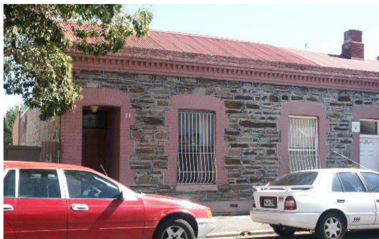
Attached cottage, 23 Claxton Street — View to northwest

OTHER ASSESSMENTS Donovan Marsden & Stark, 1982; City of Adelaide Heritage Study, 1990; McDougall & Vines, 1993.