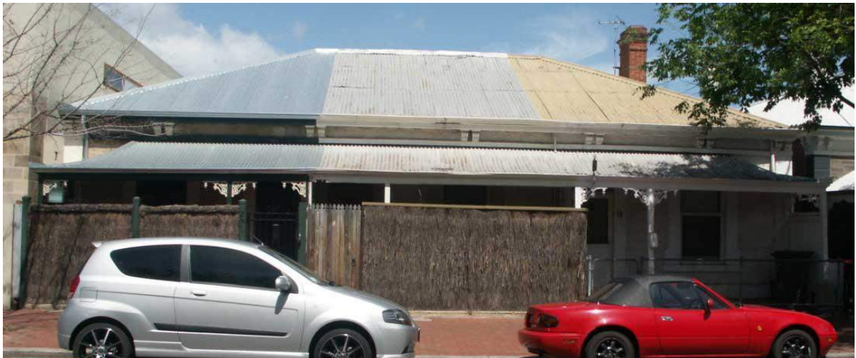
Attached cottage, 293 Carrington Street — View to south

OTHER ASSESSMENTS McDougall & Vines, 1993