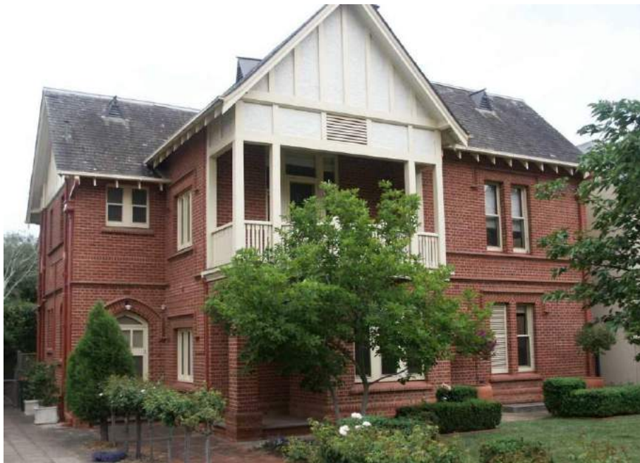
Morecroft House, 272-275 East Terrace — View to west

OTHER ASSESSMENTS McDougall & Vines, 1993