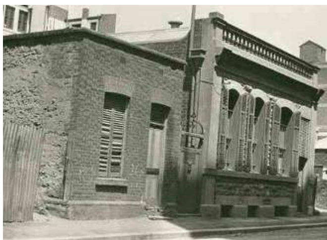
B.3131, October 1925