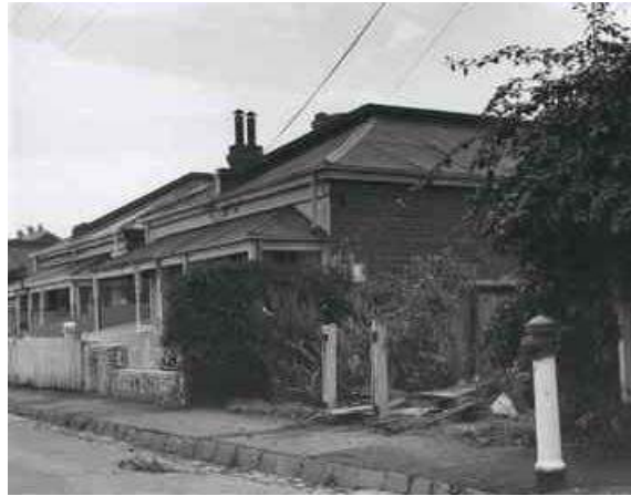
SLSA: B 23303 – Dehli Street, 1971

Ownership has continued to change, although the cottage appears little changed from its original form and scale.