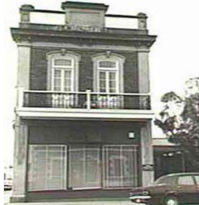
SLSA: B 38097 – Carrington Street, 1980

In 1972, an application was made to Council to demolish an existing galvanised iron structure and erect extensions to the main building for use as offices. It is unsure if this went ahead because in 1980 Council approved the demolition of an existing lean-to with an extension of the two-storey building at the rear. The extensions, as proposed, noted the use of face brick work of 'London Grey' with timber framed windows and roof extension using the same materials as the original. Provision was also made for car parking for 5–6 vehicles. At some stage, it would appear that the extension has been rendered. The architect for the project was McLeay & Harris, and the builder was S J Weir Contractors.