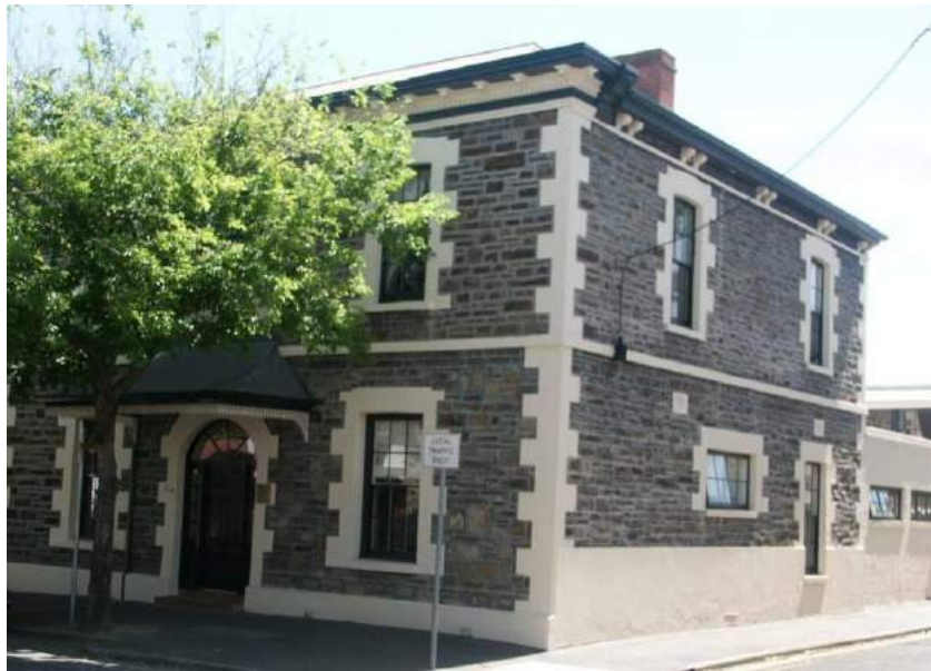
Offices, 346-350 Carrington Street— View to northwest

OTHER ASSESSMENTS McDougall & Vines, 1993