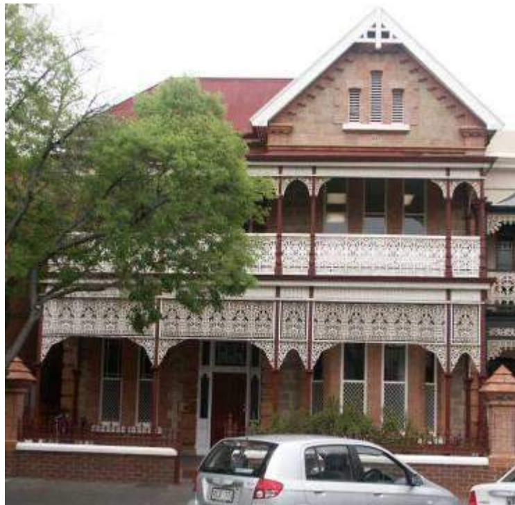
Carlton Chambers, 81–83 Angas Street — View to south

OTHER ASSESSMENTS McDougall & Vines, 1993