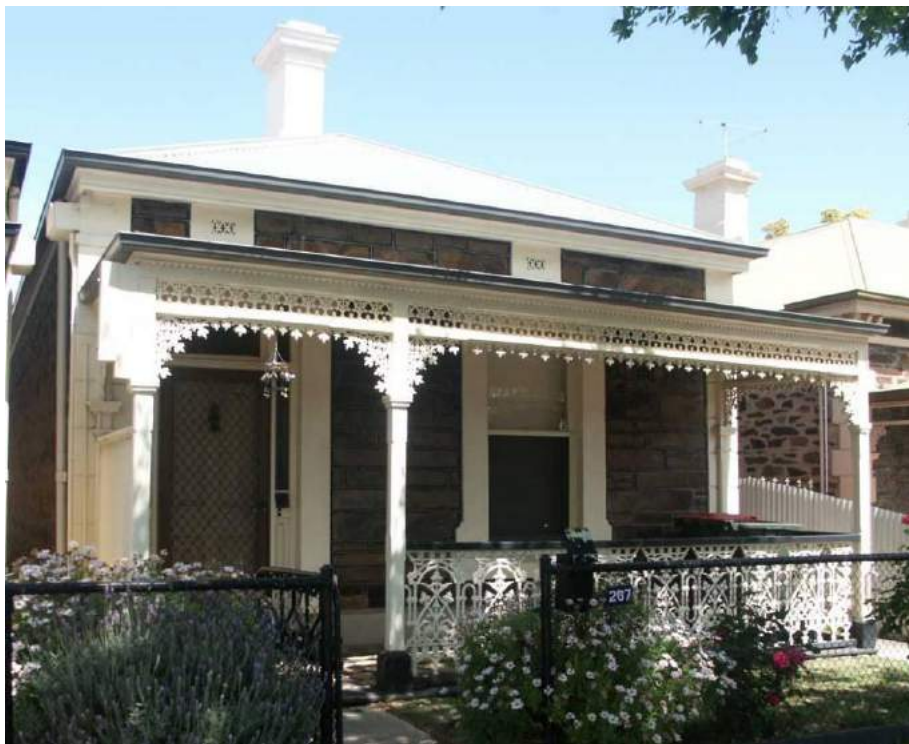
Cottage, 267 Carrington Street — View to southwest

OTHER ASSESSMENTS McDougall & Vines, 1993