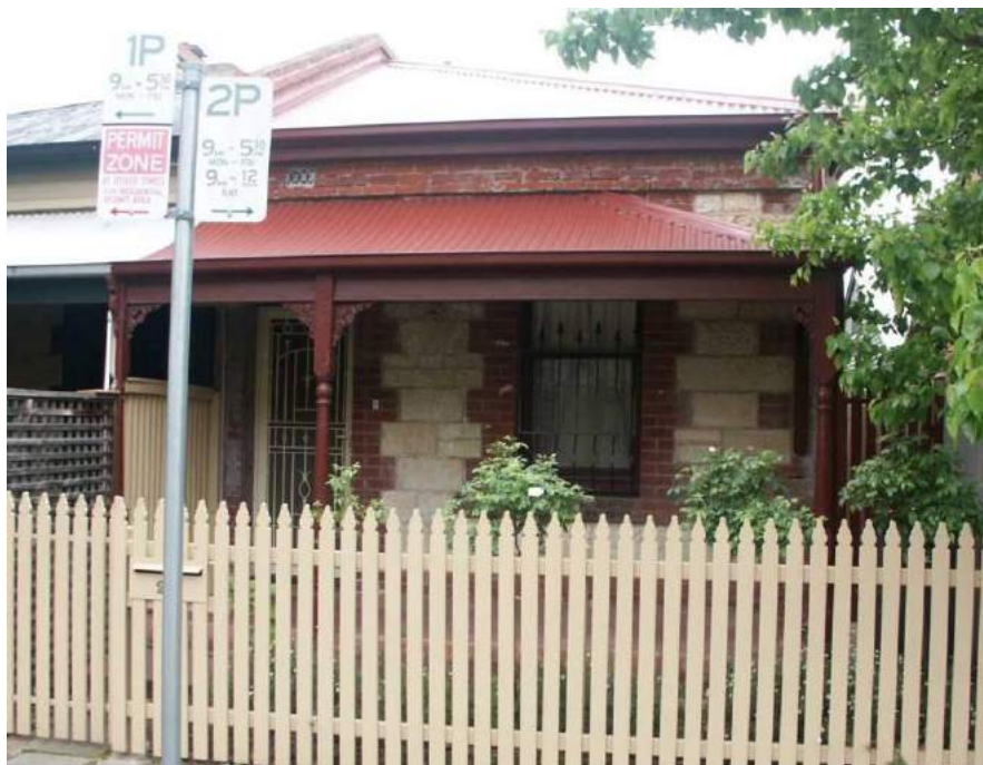
Attached cottage, 24 Delhi Street — View to north

HERITAGE STATUS: Local Heritage Place OTHER ASSESSMENTS Nil