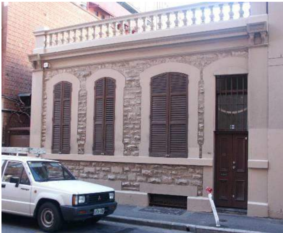
Workshop, 11-13 Austin Street – View to southeast

HERITAGE STATUS: Local Heritage Place OTHER ASSESSMENTS Nil