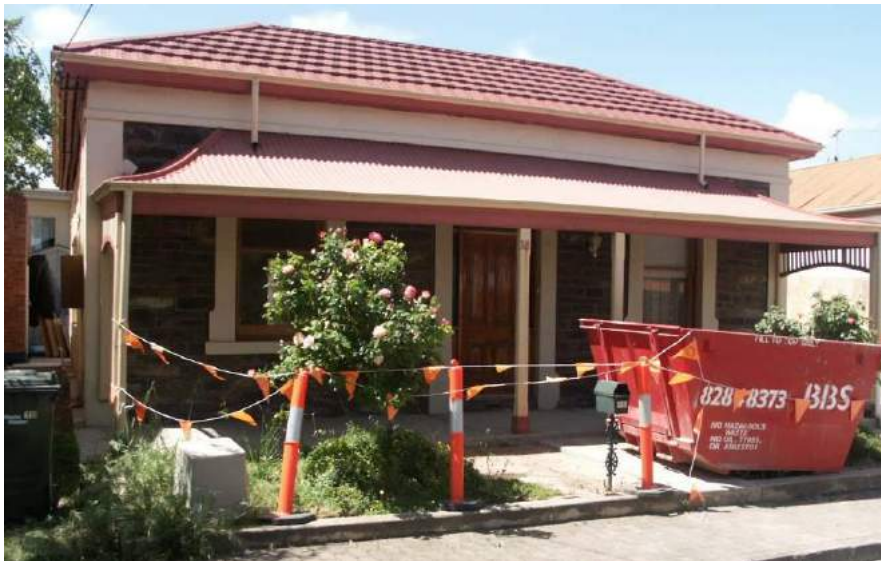
Villa, 18-20 Ada Street — View to east

HERITAGE STATUS: Local Heritage Place OTHER ASSESSMENTS McDougall & Vines 1993