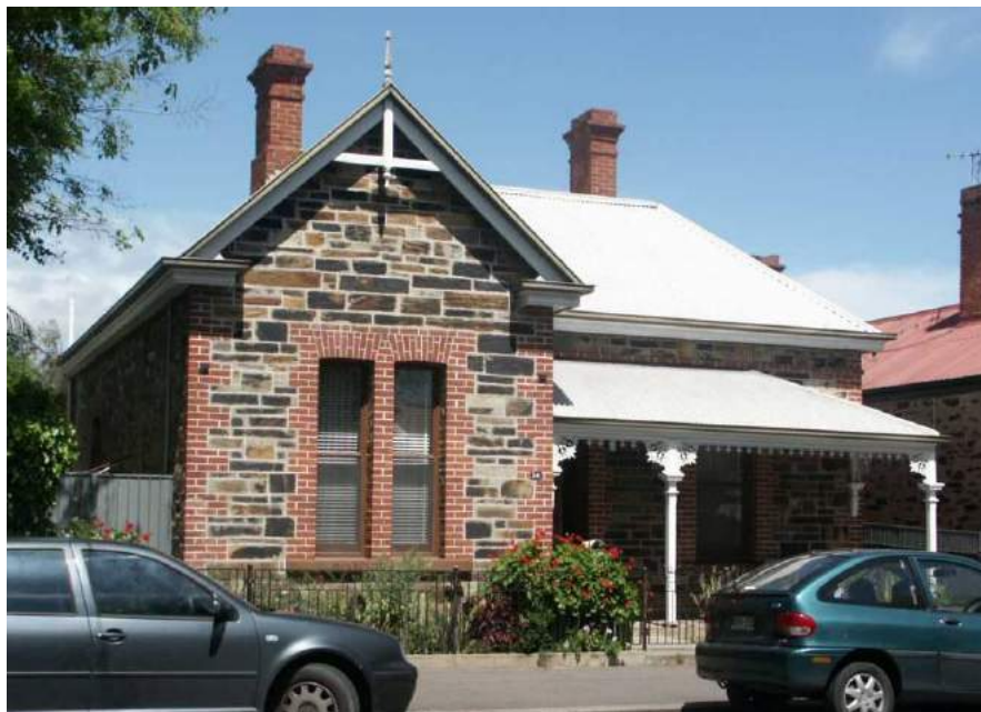
Villa, 341-343 Carrington Street

OTHER ASSESSMENTS McDougall & Vines, 1993