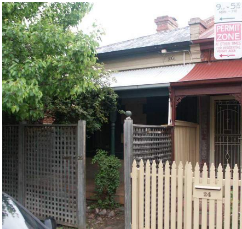
Attached cottage, 26 Delhi Street — View to northwest