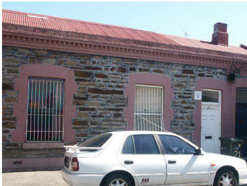
Attached cottage, 21 Claxton Street — View to northwest

OTHER ASSESSMENTS Donovan Marsden & Stark, 1982; City of Adelaide Heritage Study, 1990; McDougall & Vines, 1993.