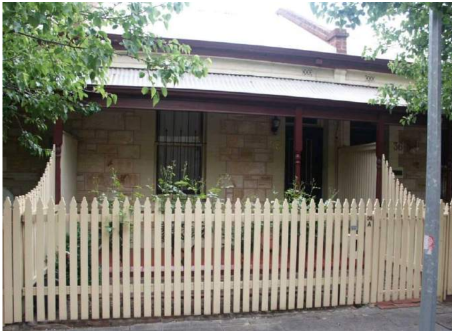
Attached cottage, 36a Delhi Street — View to north

HERITAGE STATUS: Local Heritage Place OTHER ASSESSMENTS Nil