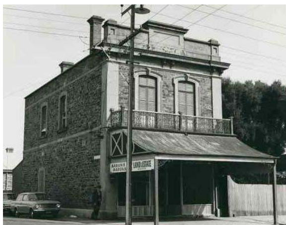
Dulwich Centre, Carrington Street, 1965