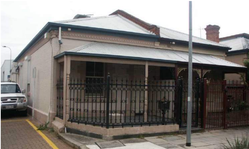
Attached cottage, 30 Delhi Street — view to northeast

HERITAGE STATUS: Local Heritage Place OTHER ASSESSMENTS Nil