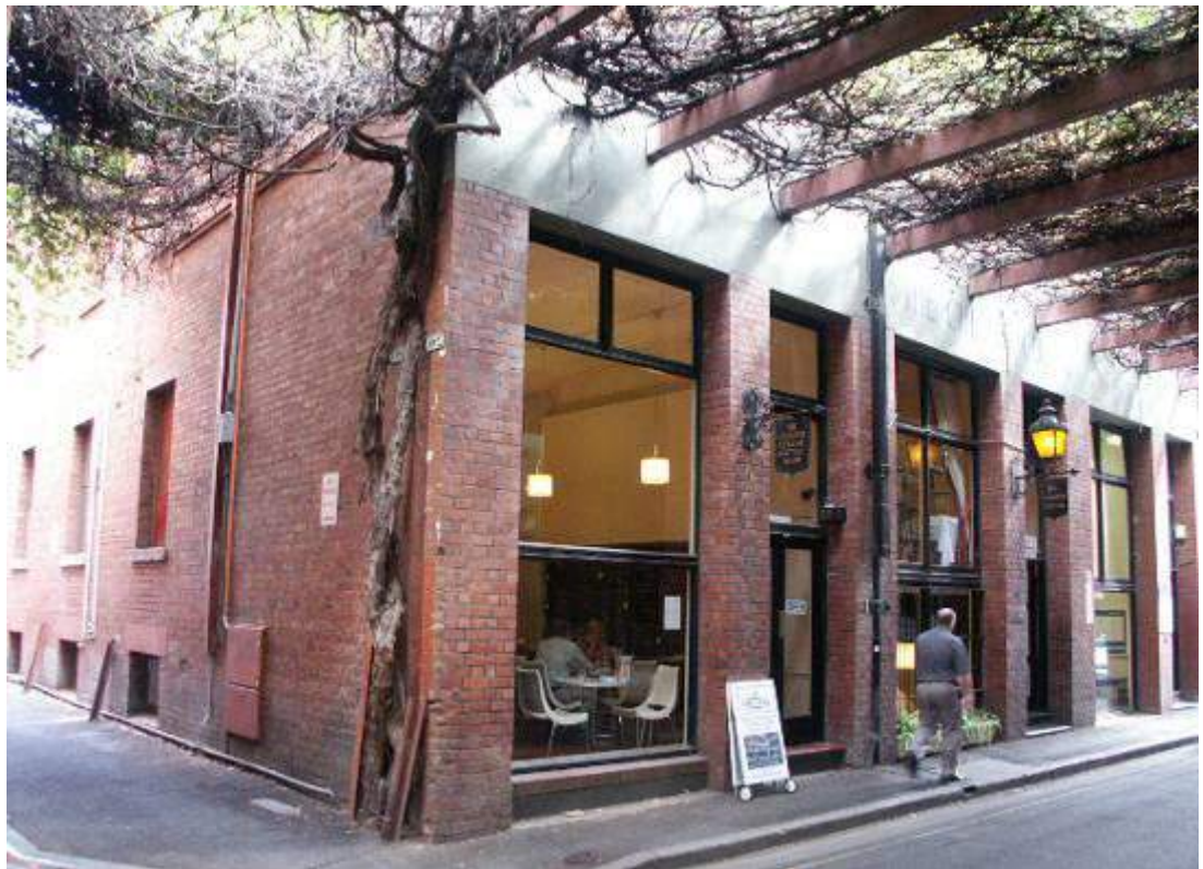
Chesser Cellar—View to northwest