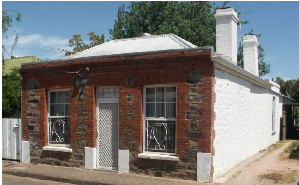
Cottage, 11 Ada Street — View to southwest

HERITAGE STATUS: Local Heritage Place OTHER ASSESSMENTS McDougall & Vines 1993