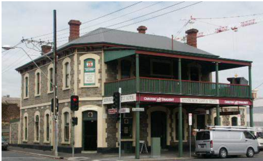
Edinburgh Castle Hotel – View to the southwest

HERITAGE STATUS: Local Heritage Place OTHER ASSESSMENTS McDougall & Vines, 1993