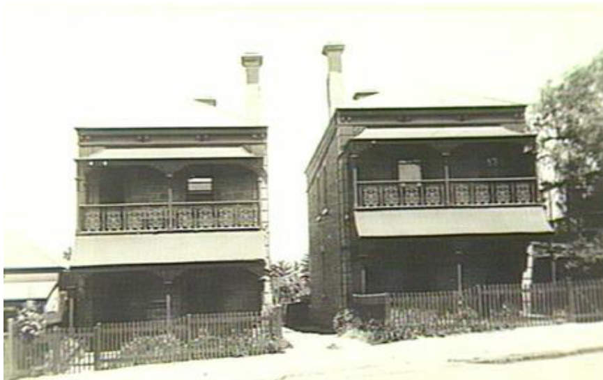
1936 view of 145 and 147 Kermode Street