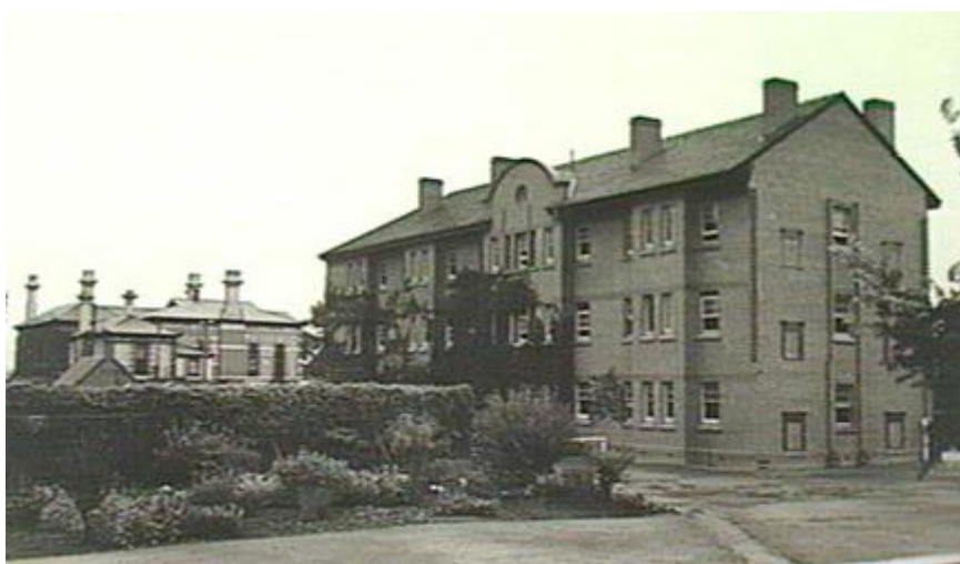
SLSA - B10298 - 1940