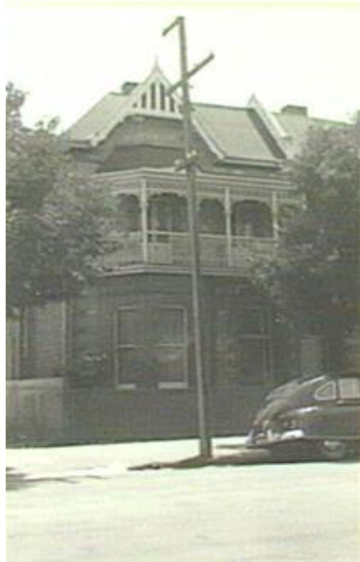
SLSA - B13193 - 1954