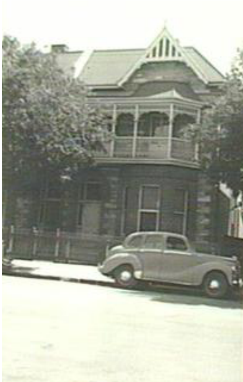
SLSA - B13192 - 1954