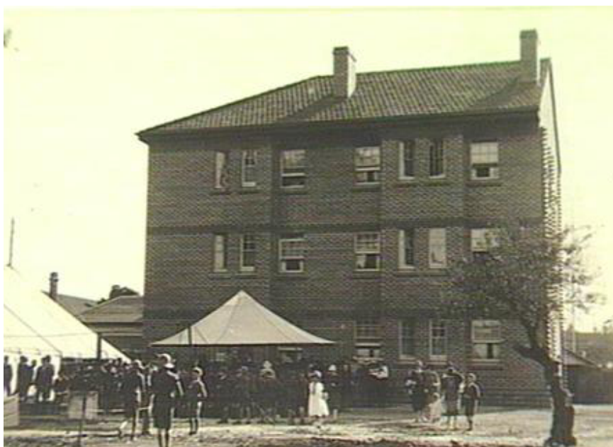
SLSA - B3397 - 1926