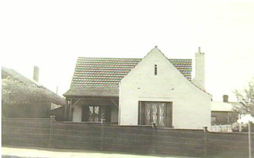
SLSA - B6954 - 1937