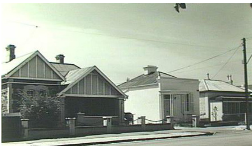
SLSA - B 15703 - 1964