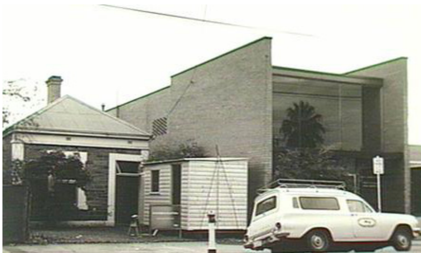
1970 view