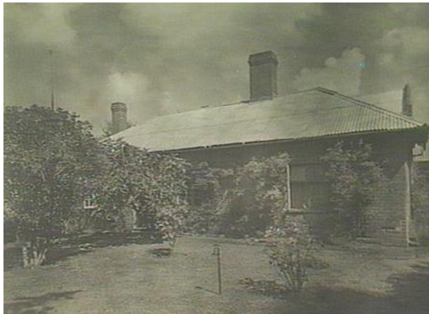
The Sheridan Institute in January - SLSA - B 5317 - January 1901