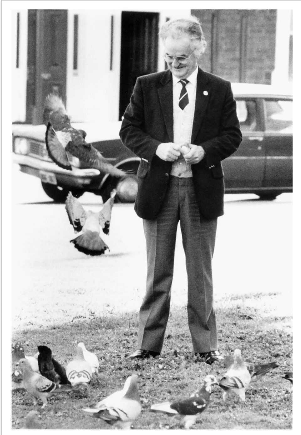
Peter Griffin among the pigeons, 1988.