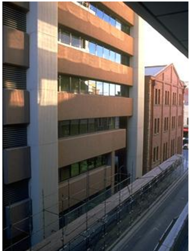
(CD Ref 3971/98)