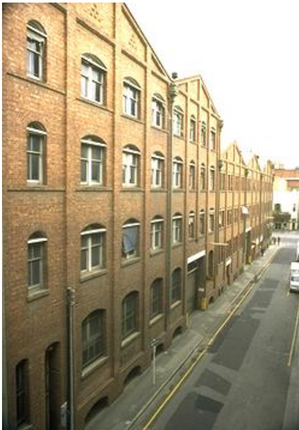
(CD Ref 3971/97)

Architecturally the building is significant because of the detailing evocative of the American Romanesque, which though more commonly found in the eastern states is rare in Adelaide. It was designed by the notable Adelaide architectural practice, English & Soward, and built by N. Trudgen. This is also one of the few warehouses of this scale to survive in the city centre.