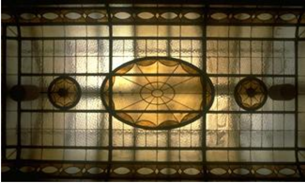
(CD Ref 3974/59)