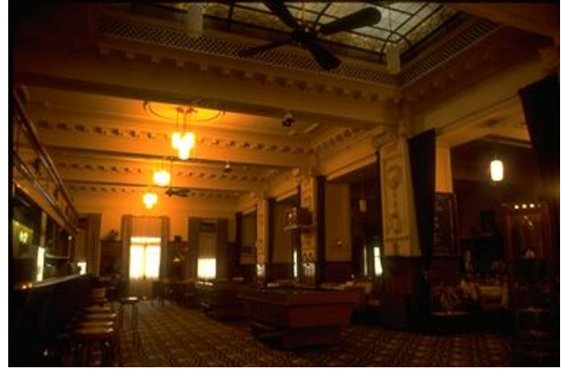
(CD Ref 3974/58)

This heavily detailed building is unusual for its obvious duality as a result of two stage construction, the western part in 1916-17 and the eastern half in 1927-28. The integrity of the building is high. The 1928 extensions simply complemented the original building with identical bulk and detailing. The interior retains original spaces and details. The building is important for the vigorously proportioned and modulated facade and for the inclusion of a central light well which illuminates a central stained-glass lantern over the club dining-room.