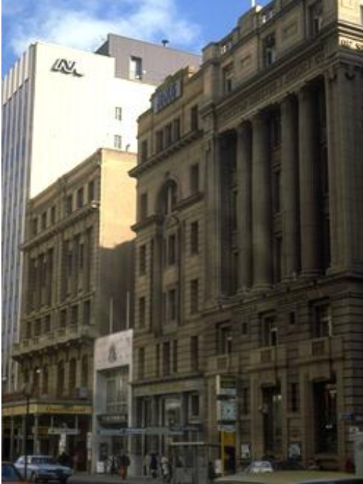
(CD Ref 3974/57)

Tattersalls Club building is a major streetscape element. With the New Zealand Bank building and the Executor Trustee building to the east, it forms part of a significant group.