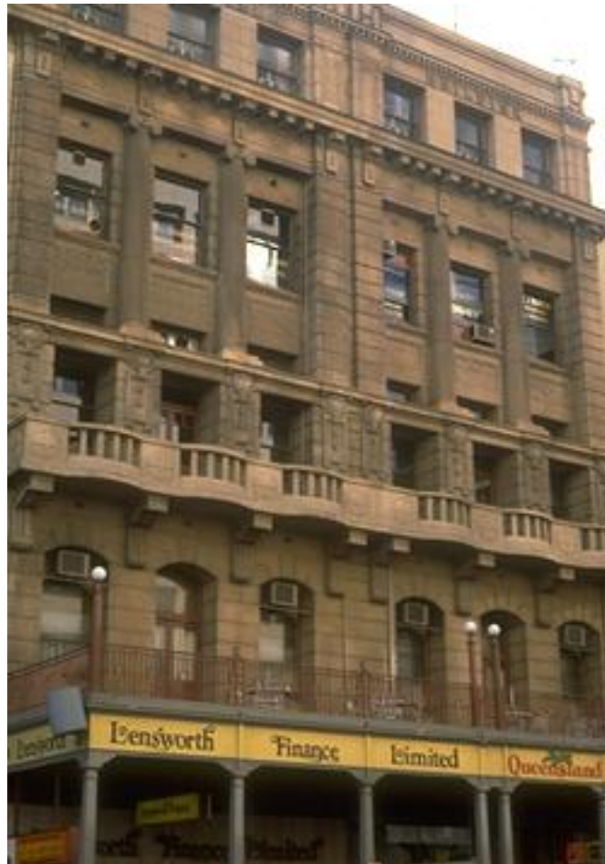
(CD Ref 3971/84)

This heavily detailed building is unusual for its obvious duality as a result of two stage construction, the western part in 1916-17 and the eastern half in 1927-28. The integrity of the building is high. The 1928 extensions simply complemented the original building with identical bulk and detailing. The interior retains original spaces and details. The building is important for the vigorously proportioned and modulated facade and for the inclusion of a central light well which illuminates a central stained-glass lantern over the club dining-room.