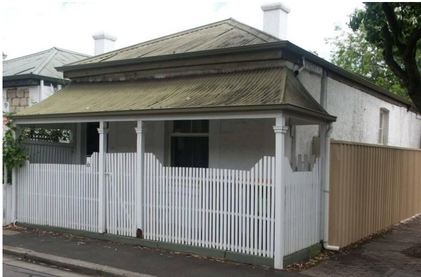
Cottage, 13 Vincent Street — View to southwest

HERITAGE STATUS: Local Heritage Place OTHER ASSESSMENTS Nil