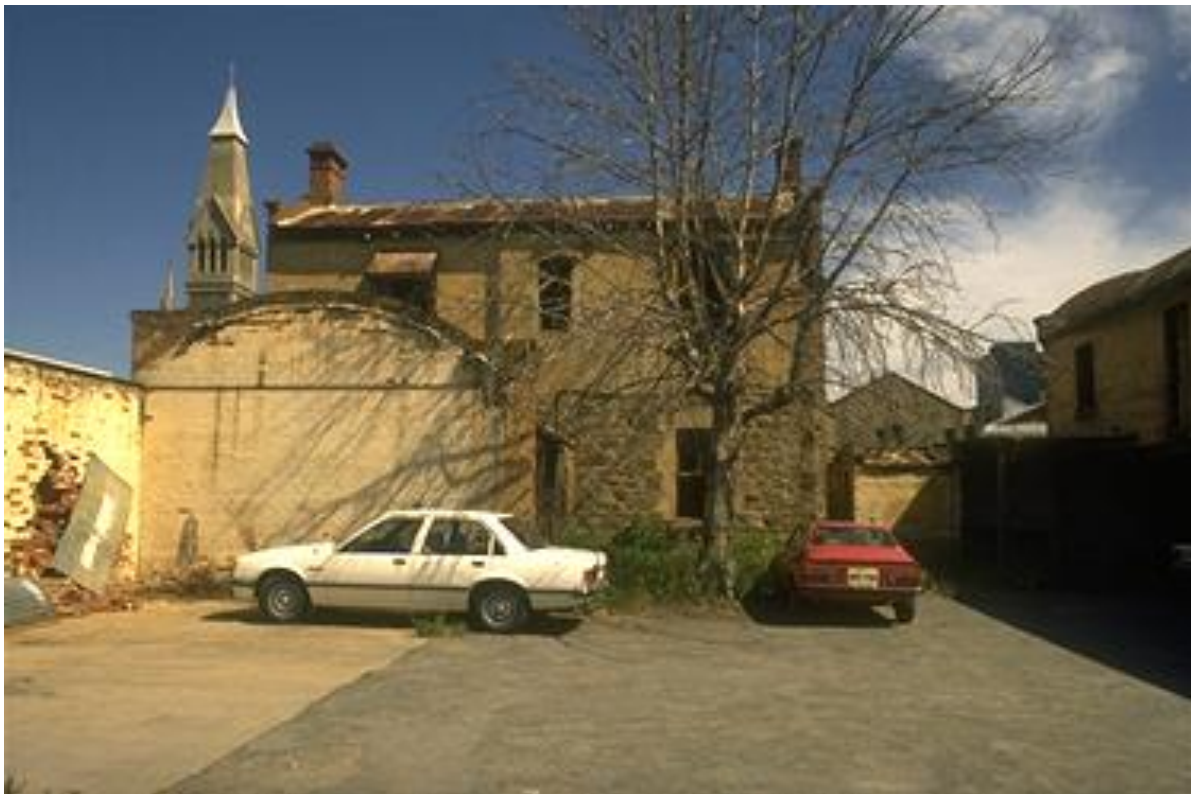
Prior to Adaptation (CD Ref 3964/53)

As the elaborate head offices of South Australia's leading businesses were erected at the city centre, their equally important warehouses and transport depots were constructed in less public thoroughfares at the margins of the centre. As stabling was required for the many hundreds of horses which hauled the firms' goods and supplies, many of these, together with several large livery and letting stables, were located within the city. During the late nineteenth century livery stables stood cheek-by-jowl with cottages, shops and churches of the surrounding city, as shown in panoramic views of Adelaide at the time. Probably the best surviving example of such large horse transport premises is this extensive brick and stone complex off Frome Street.