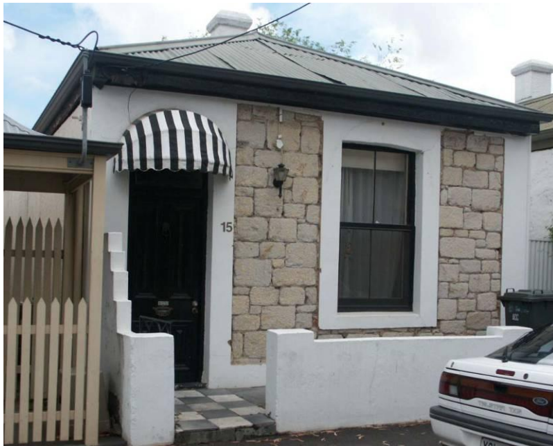
Cottage, 15 Vincent Street — View to west

HERITAGE STATUS: Local Heritage Place OTHER ASSESSMENTS Nil