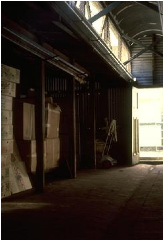
Interior now Demolished