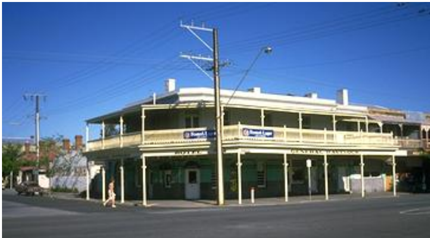
(CD Ref 1343/51)

The hotel served a clientele living in the South-east of the city which was at that time the least populated area. The engraving of Adelaide published as a supplement to the Illustrated Sydney News , July 1876 while not totally accurate, conveys an impression of clusters of cottages and shops with large stretches of vacant land in the area east of Hutt Street. The Smith Survey of 1880 records that the vacant areas were beginning to be developed and that some of the developed town acres were more densely filled. The General Havelock and the Arab Steed (on the corner of Gilles Street and Hutt Street) were the first hotels in this south-east corner.