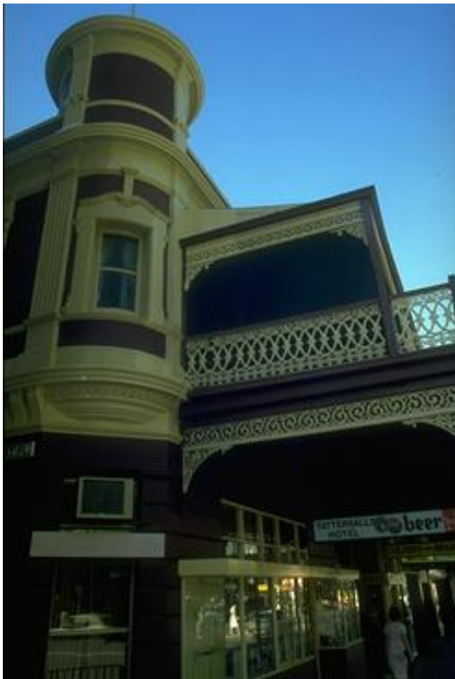
(CD Ref 3974/89)