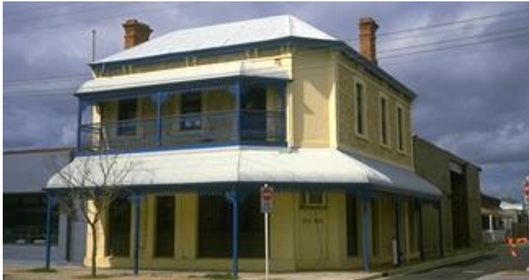
(CD Ref 1347/86)