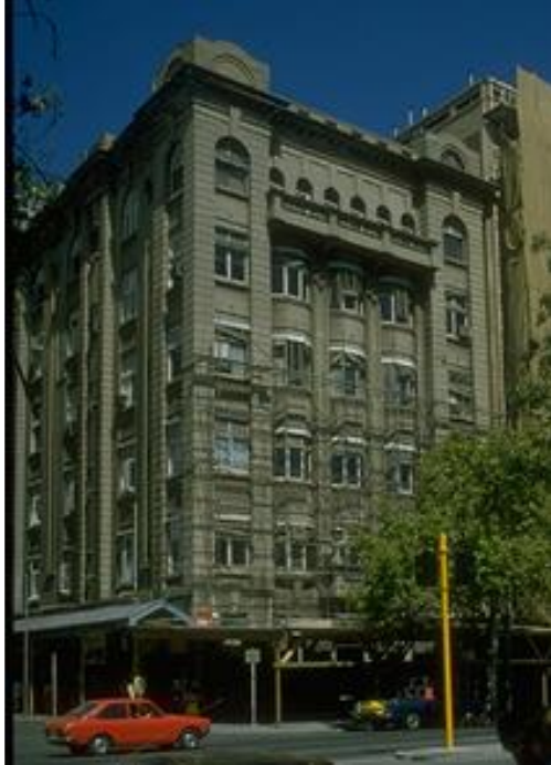
(CD Ref 3982/12)

This building is one of the earliest and most complete of Adelaide's reinforced concrete buildings to have survived. It was built as Adelaide's tallest building and the first high-rise block on North Terrace, hastening its change from residential to commercial use.