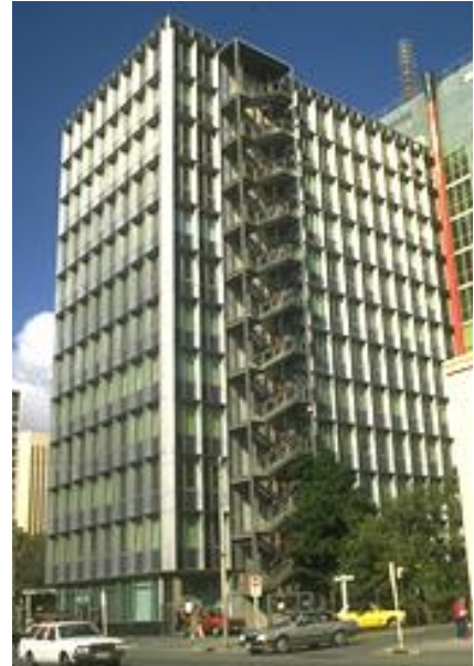
(CD Ref 3971/10)

The architects Bates, Smart and McCutcheon of Melbourne, assisted in Adelaide by Lawson, Cheesman, Doley and Partners, applied the principles of this research to the construction of the MLC building which was adapted for Australian materials and conditions. MLC lauded their achievement and claimed that ' . . . the beauty of our structure of pale green, purple and silver, holds and delights the eye from all quarters, and in sunlight or under grey skies it is undoubtedly the outstanding building of Adelaide'.