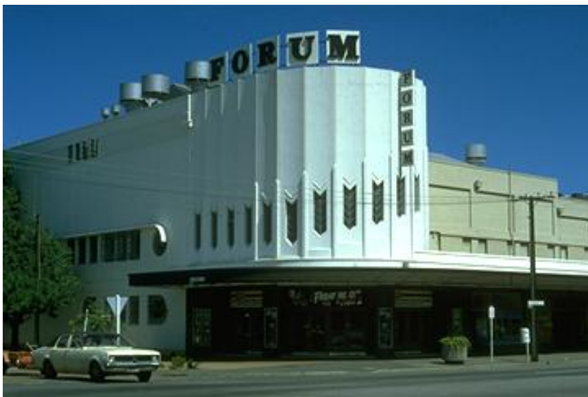
(CD Ref 1345/74)

The Piccadilly was one of the last cinemas erected before the Second World War stopped construction of buildings for almost six years. Ross Thorne in Cinemas of Australia via U.S.A. described the building as being at a cross-roads in design, with no particular theme connecting its design elements.