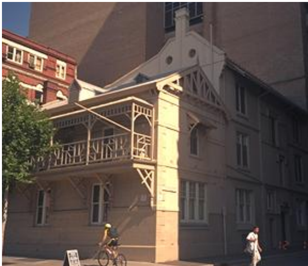
(CD Ref 2016/17)