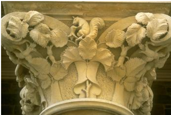
(CD Ref 3964/13)

Stow Memorial Church (now Pilgrim Church) is an important part of the Victoria Square environs. The building is of intrinsic merit with bluestone walling well dressed with sandstone. The detailing of the porch is exceptionally fine. The capitals are of Caen limestone (France) and quatrefoils in Bath limestone (England). The contrast between the materials and the crisp detailing and robustly carved relief, all of which remain in good condition attract the eye and display the virtuosity of the mason's craft. The building's interesting composition is a significant departure from the primarily axial Gothic churches, the small aisles behind a well detailed 'screen' of arcading, and the relatively large transepts, achieving a surprisingly intimate interior. The composition, if completed with the spire over the tower as in the original design, would be dramatic, stamping the building as architecturally 'fashionable' for the 1860s, even in Britain. It justifiably won the acclaim of critics and remains significant to the historical development of the Congregational Church and the quality of architecture in South Australia at a time when the colony was gaining confidence and prosperity.