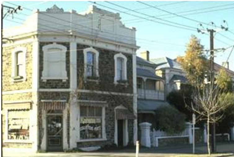
(CD Ref 1345/18)

Rate assessments for November 1883 record that this shop, built for E. Kelsey, was unfinished. In August 1884 plans were passed by Council for a veranda over the entrance and large shop windows. Thus, by the mid-1880s the development of upper North Adelaide had created a community of sufficient size to support a substantial general store well away from the commercial 'centre' of O'Connell Street. The 'corner store' continued in use until well into the 1960s and still functions as a popular wine store.