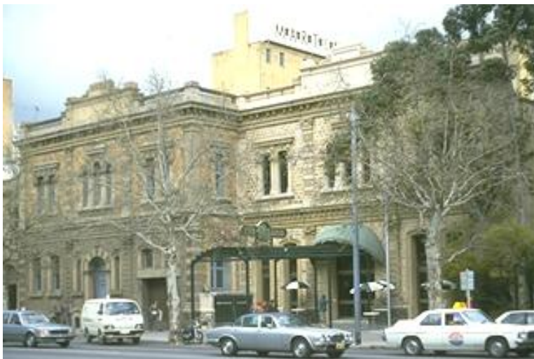
(CD Ref 3974/78)