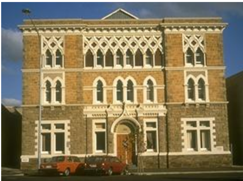
(CD Ref 3964/60)

On 7 August 1896 tenders for the erection of the first section of the institute building were advertised by the architect F.W. Dancker. The building was opened on 23 February 1897 and was sold by the OBI to the minister of education in 1961.