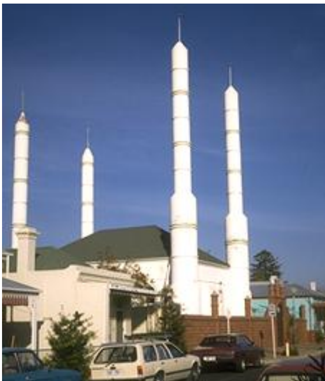
(CD Ref 3964/18)

Camels were first imported in substantial numbers into Australia in 1866 by Thomas Elder whose partner had selected both the animals and their handlers (Afghans) mainly from northern India. They were landed at Port Augusta and almost immediately proved their usefulness in outback transport, carrying heavy materials in exploration and patrol.