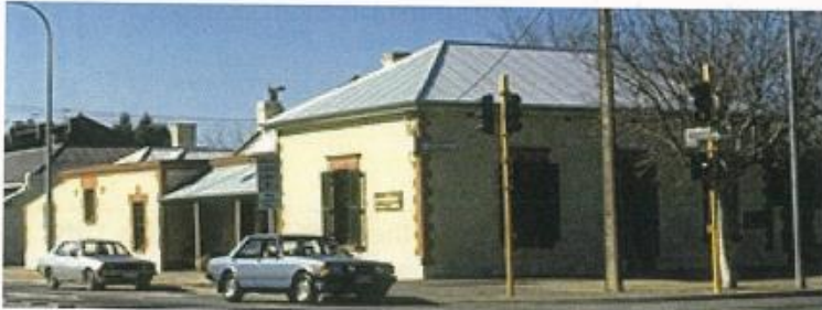
(CD Ref 1344/8)

While large sections of upper North Adelaide lay vacant until as late as the 1880s, Jeffcott Street was such an important thoroughfare that houses and other buildings were constructed there as early as the 1840s and 1850s. Even at the most isolated