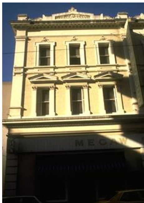
(CD Ref 3982/32)

A history, of Bickford's is given in the description of their adjacent building in Currie Street (now the Anglican Church Office). The new building was leased to other businesses upon completion, including Cowen and Sons, and W. Detmold, although Bickford's continued to construct new premises, including a factory at West Croydon in the 1920s.