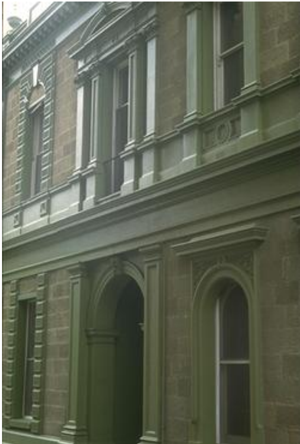
(CD Ref 3964/69)

professional rooms until the present owners purchased the property and restored it as a private home.