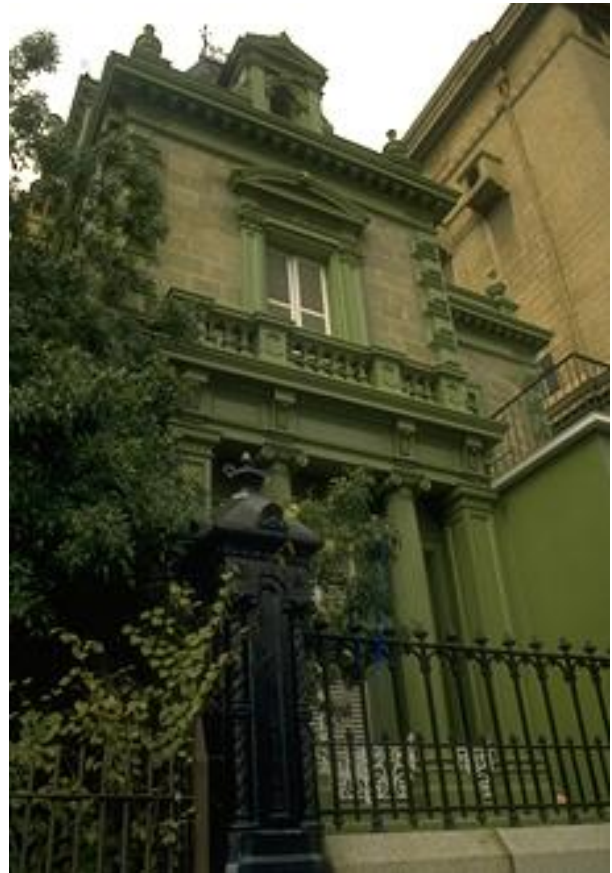
(CD Ref 3974/38)

The building is of architectural interest because of the high quality of detailing to both the North Terrace and western elevations. The surrounds to openings are well finished, with a variety of stucco ornamentation including foliated capitals and spandrel decoration. The design has been marred by the removal of a balcony, but the imposing mansard roof with its slate cladding, the widow's walk and parapet survive intact. Morgan and Gilbert commented in Early Adelaide architecture , that the design ' . . . although elaborate is well scaled to so small a house'.