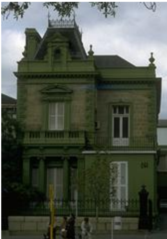
(CD Ref 3974/39)