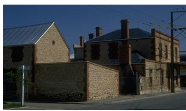
(CD Ref 3971/42)