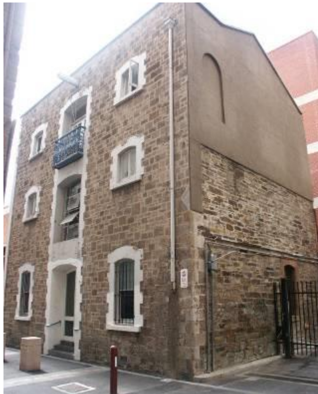
28 Peel Street (Former Warehouse)—View to northeast

OTHER ASSESSMENTS McDougall & Vines, 1993