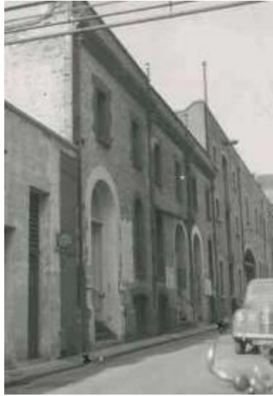
Warehouse in right background, B.13113, July 1954

This building was later used as a restaurant, a coffee lounge, a café, and later professional offices. For some time there was second floor access via a walkway to 32 Currie Street; the doorway was bricked up in 1987 and the link building removed in 1990.