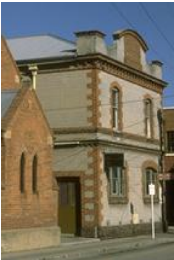
(CD Ref 1343/95)