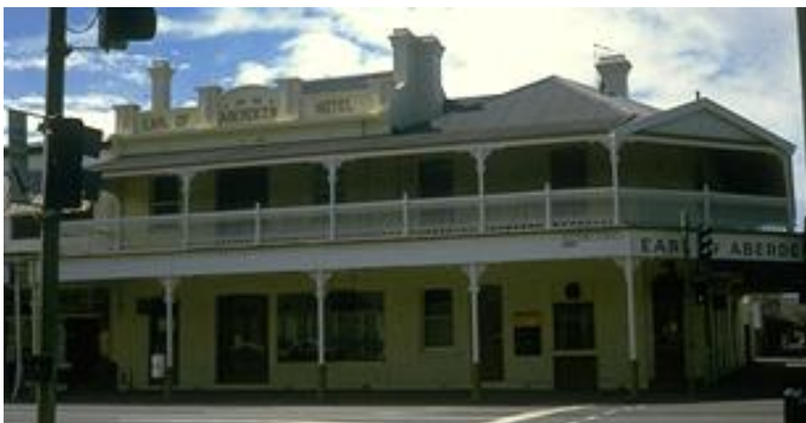
(CD Ref 1343/65)

By the 1870s the Devon Arms was competing with both the Green Dragon and the Labour in Vain, despite the compensations of an increased local clientele. In the face of formidable competition the Devon Arms premises were updated by rebuilding a new hotel on the same allotment, either over the site of the former hotel or alongside. This was described as 'a nice building', as indeed it is today. The building was extended to the north in 1924, and a veranda/balcony was erected across the Pulteney Street facade, returning along the Carrington Street facade to unite the two buildings.