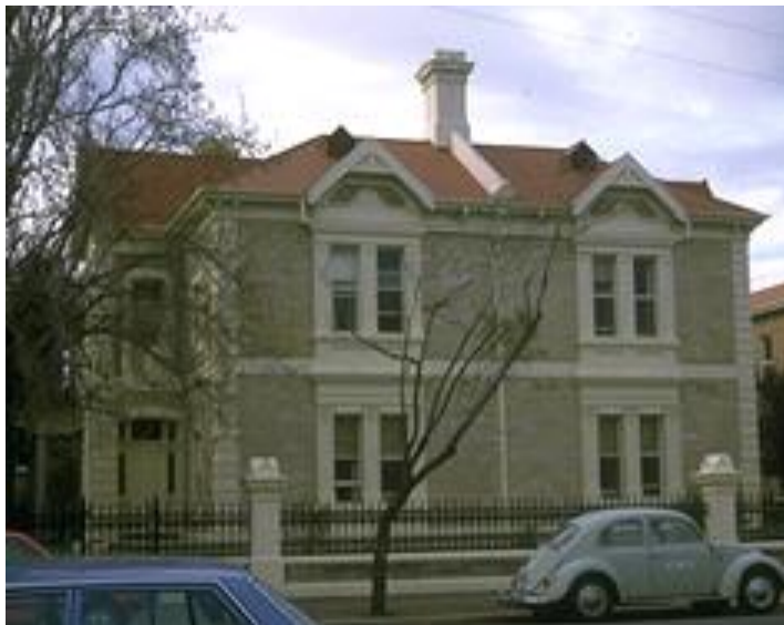
(CD Ref 1215/51)

These semidetached former houses were among the several grand residences built during the redevelopment of Brougham and Palmer places at the turn of the century.