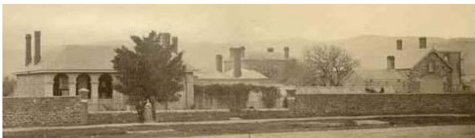
B.8856, c. 1872