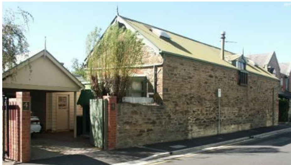
Former coach house, 4-8 Nil Street – View to northeast

HERITAGE STATUS: Local Heritage Place OTHER ASSESSMENTS McDougall & Vines, 1993