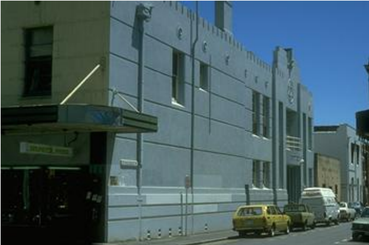
(CD Ref 3964/74)

The complex of synagogue and shops is of importance to Rundle Street being of similar scale to its neighbours and development elsewhere along Rundle Street. The complex has been little altered since the refacing in 1938 and the synagogue interior retains much of its 1870s character.