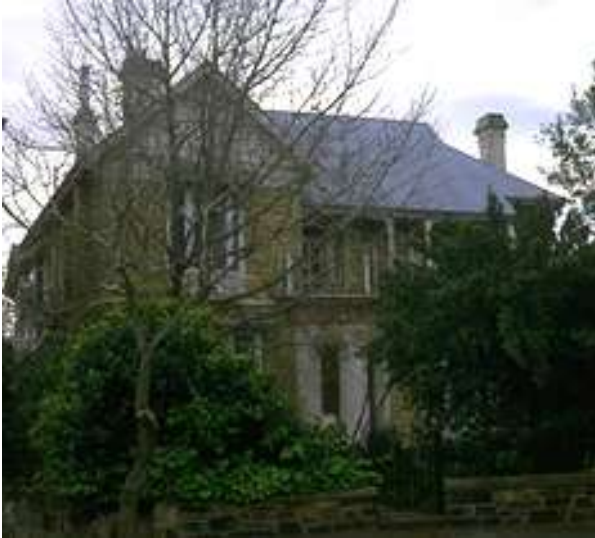
(CD Ref 1215/32)

This house, and its neighbour Taylor House, are important survivors of the redevelopment of Brougham and Palmer places which occurred around the turn of the century. They make a considerable contribution to the special character of the Brougham Place ridge.