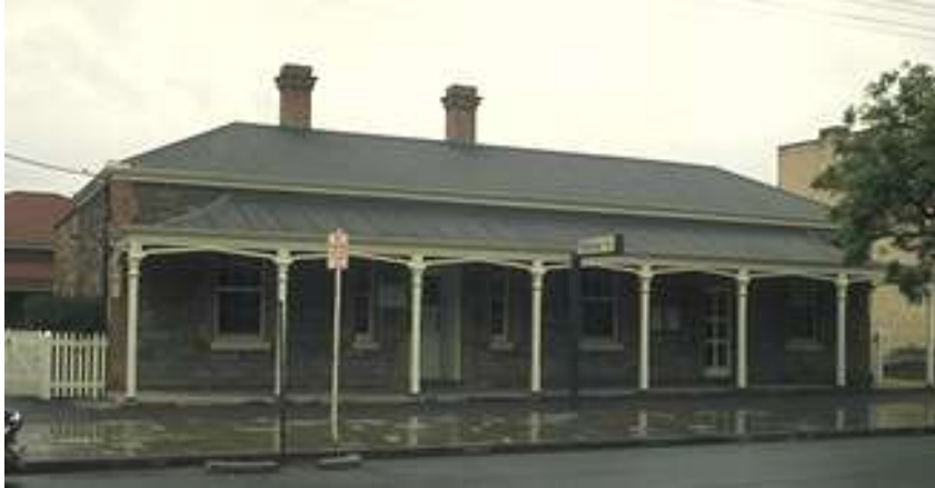
(CD Ref 1724/13)