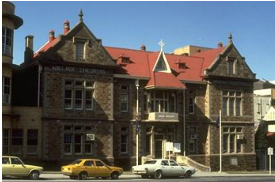
(CD Ref 1215/41)

A building committee had already produced sketches of a new building designed to form a quadrangle with the existing buildings, and with a frontage to Poole Street (King William Road). Angas engaged the architect Alfred Wells and had the plans redrawn. The building was constructed during 1893 and opened on 1 May 1894 by Angas.