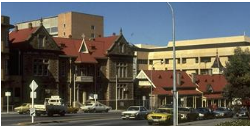
(CD Ref 1721/93)

The building is similar in form to a number of the public model schools of the day, and is of a simple utilitarian design with overtones of the Gothic Revival. It is well constructed of squared random coarsed sandstone set over a bluestone plinth. The building stone was described at the time as Little Para freestone from Thomas Williams' quarry near Salisbury.