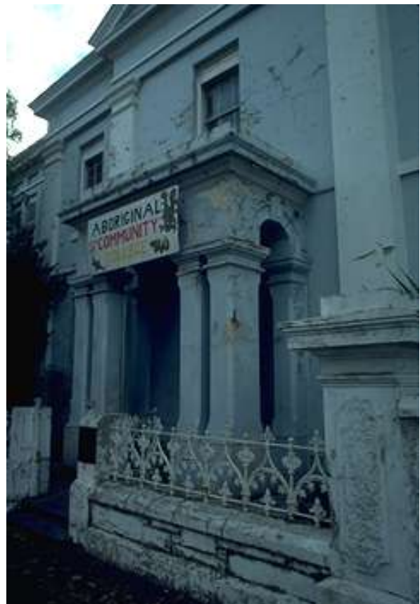
(CD Ref 1345/65)