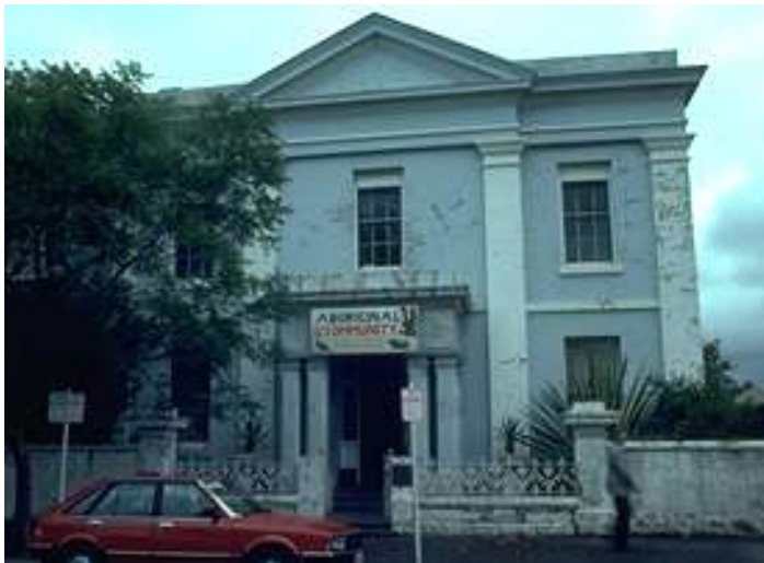
(CD Ref 1345/66)