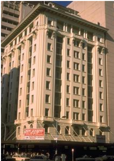
(CD Ref 3971/82)

Australian people had quickly come to a full realisation of the benefits of assuring in mutual companies. Provision was made for old age when death overtook the breadwinner families were provided for and not left to the mercy of the world.