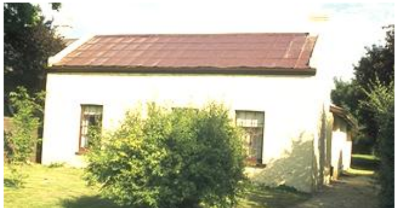
(CD Ref 1721/40)

The buildings, of limestone brick and pug (pisé), are indicated as stone and brick in the Smith Survey, yet the Kingston map shows them as constructed of pisé. The almost identical plan form would, however, indicate a high degree of historical continuity. The structure displays pioneer building techniques and is one of the few buildings in the city